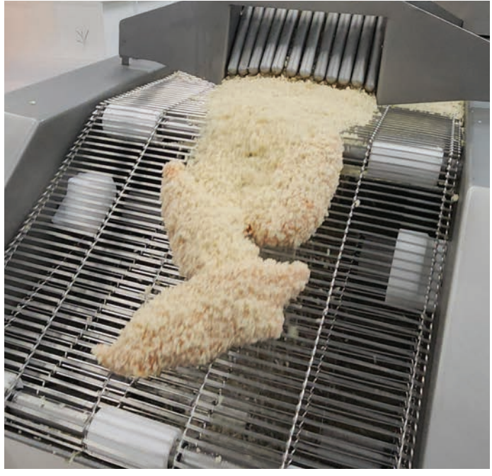
Modifications made to the machine at time of purchase may change the technical specifications.