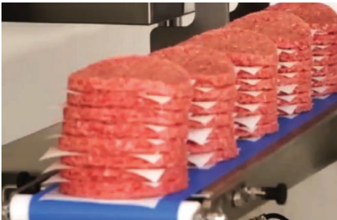
High Efficiency - up to 3,300 units/hr