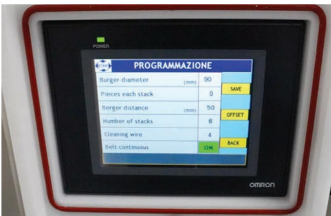
Touchscreen & programmable user interface