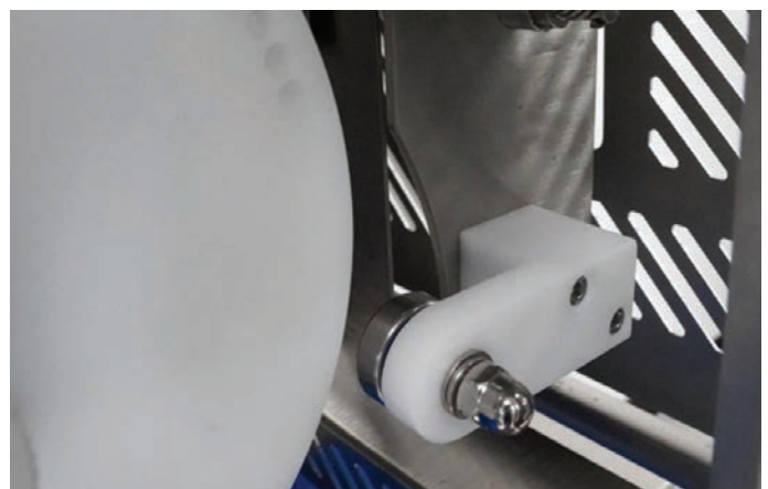
Automatic paper feed