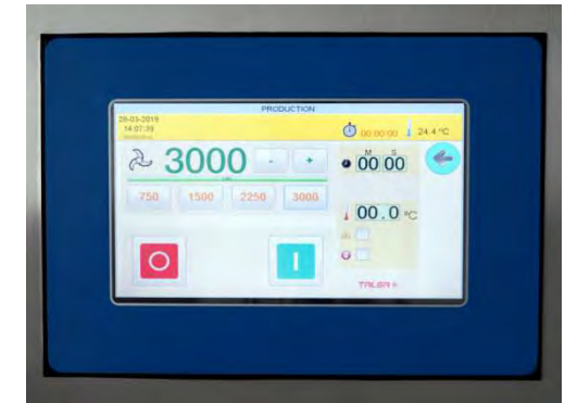
7" digital touch screen.