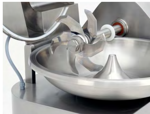
Optional 6-knife head.