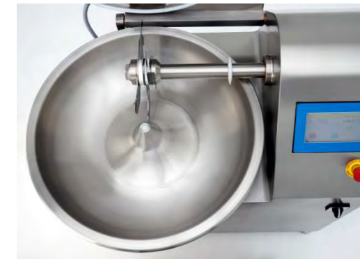
Solid cast stainless steel bowl. CNC precision machining.