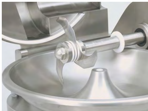
Removable knife head with 3 knives (standard).