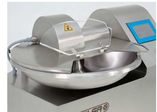
Transparent noise protection cover.