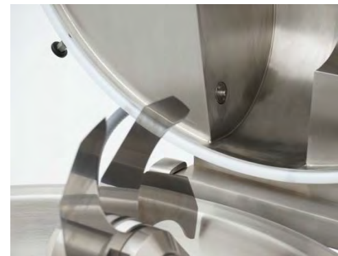
Removable, self-adjusting friction lid/bowl band.