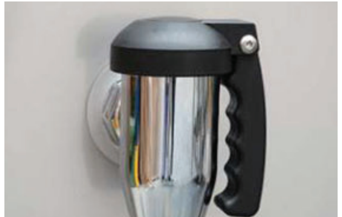
Safety guard preventing accidental release