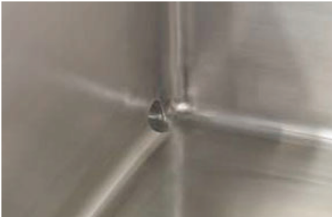
Recessed corners for easy cleaning