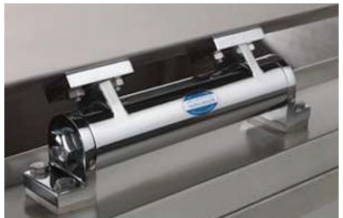
Effortlessly open & close from 20° - 80°