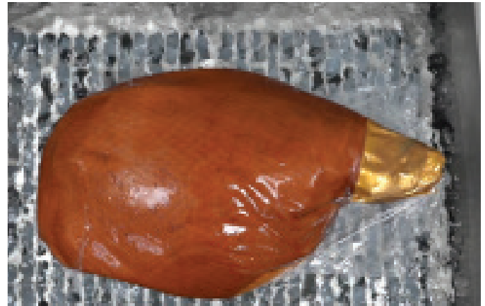
Manufactured in Holland