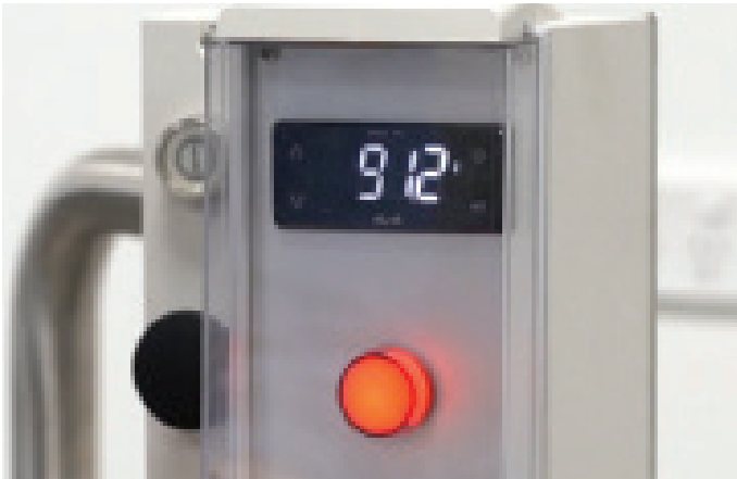
Automatic temperature control