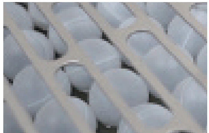
Complete with insulation balls