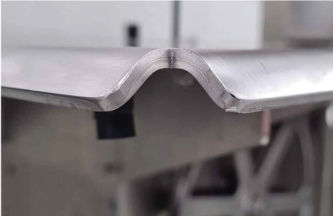
5mm Thick Table