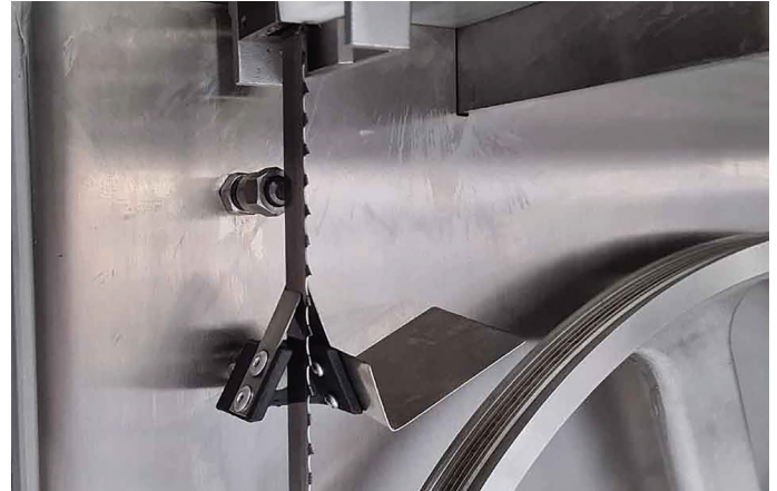
Blade Scraper Deflector