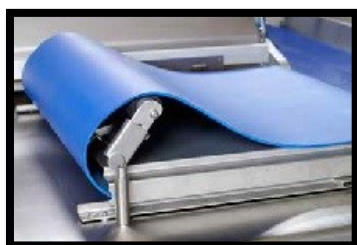
Advanced Control System